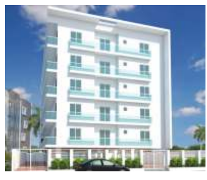
NAVYA LINGALA RESIDENCY Uppal Bhagath