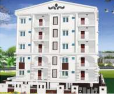
NAVYA VAZEER HOMES Uppal Bhagath