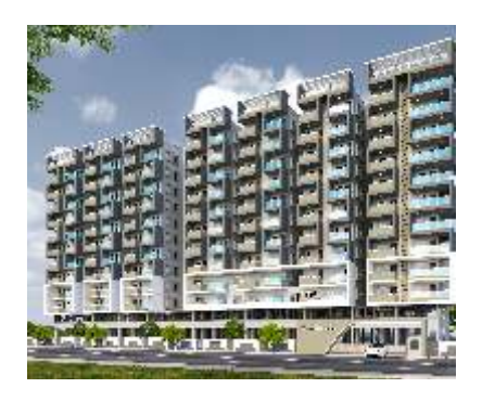
NAVYA HARMONY Peerzadiguda