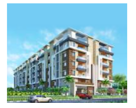
NAVYA TRINITY Boduppal