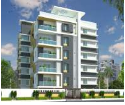
NAVYA SS ARCADIA Vijayapuri Colony - Kothapet