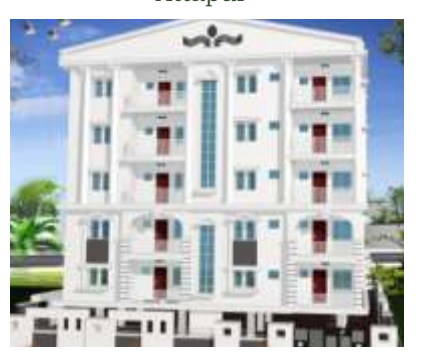
NAVYA LINGALA CASTLES Uppal Bhagath